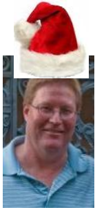
From the Grand Knight:

Mother Council of Georgia December 1, 2009